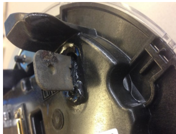
Meter damaged by hot socket