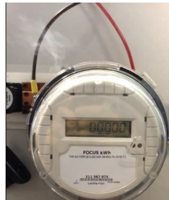
Simulated hot socket meter beginning to smoke

Visit TESCO's booth #3903 for a demonstration. You can also see this technology in action at LANDIS+GYR's booth #2413 .