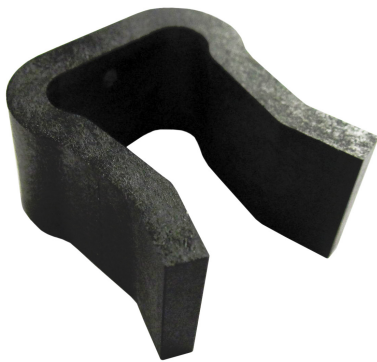
SOCKET SAFETY CLIP CATALOG NO. 301

TESCO's Socket Safety Clip has been designed to give meter technicians a way to temporarily reassure that a hot socket will not affect a faulty meter socket jaw. The danger zone of a meter socket jaw is 5 lbs. of holding force. At 5 lbs. arcing can occur, resulting in a more serious problem, failure, or electrical fire. The Socket Safety Clip improves the holding force of a meter socket jaw to close to 20 lbs., and can withstand temperatures beyond 400 degrees. This temporary solution simply clips around the jaws of a meter socket until the socket can be replaced.